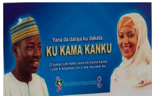
(b) Hausa Version