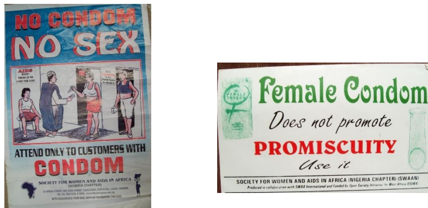
Fig. no. 4: (a) Poster on “No Condom, No Sex. (b)” Sticker on “Female Condom” (Culled from SWAAN)

director adopted the particular logo he liked without the target audience involvement in the development process through pre-test, the necessary improvements made on the logo, would not have been possible. The addition of a wedding ring on the finger of the pictured mother in the logo, is very significant and instructive. It pinpoints the socio-cultural role in the determination of target audience perception, interpretation, and response to graphic communication. The ‘Use Condom’ communication campaign, is an example of efforts towards production of practical rhetoric that failed because it neglected the described/prescribed utilization of independent variables of communication and dependent variables of persuasion. The IEC material examined are a poster and a sticker (Figure 4 a, and b) respectively.