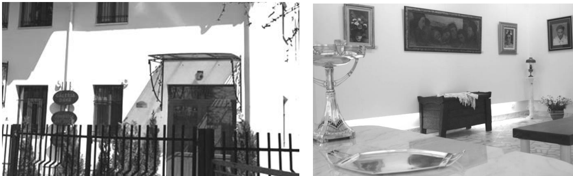
Fig.10, 11. Galeria Dana din str. Cujbă 193

framework of artistic expression to alternative 191 exhibition manifestations. Also malls from Iasi 192 are trying to rally to the contemporary cultural scale. Tus in the commercial areas have been set up spaces dedicated for exhibition events which provide a framework for various individual and collective exhibitions.