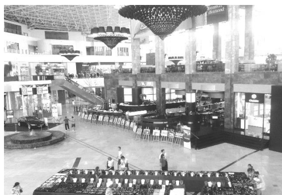
Fig. 9. Spațiul expozițional Palas Mall

The Vector Gallery appeared in 2003 as a result of the establishment of the Vector Association in 2001, being known as the organizer of the Peripheral Contemporary Art Festival. The existence of the Vector gallery was sprinkled with numerous cultural events attended by visual artists from Iași, Cluj, Bucharest, Timișoara, but also from abroad such as Italy, Slovenia, Holland, Great Britain, etc. becoming visible in the European artistic environments.