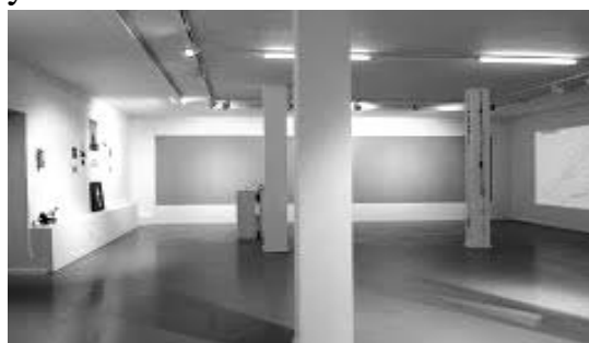
Fig. 6. Galeria ApArte