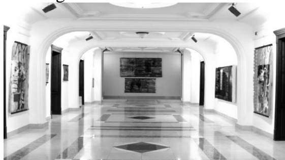
Fig. 5. Galeria Universitas

In this cultural context, also were created the ApArte and Universitas Art Galleries which belong to the George Enescu National University of Arts from Iași. Having generous exhibition spaces, they promote the initiatives of the students from the Faculty of Visual Arts and Design, being also intended for contact with the Iași public regarding the university's artistic and educational activity. Among the most important exhibitions held at the Universitas Galleries were the events of the Euroinvent International Conferences and the International Inventica Symposiums, between 2013- 2022 editions, being one of the exhibition spaces of the 2015, 2017 International Engraving Biennale, as well as other artistic events aimed at contributing to the cultural value of our city.