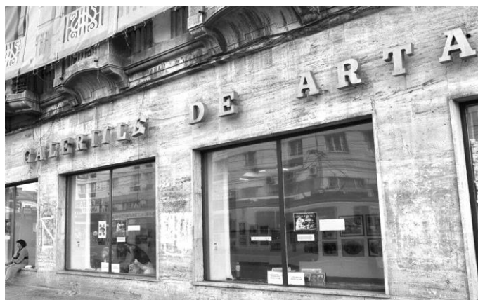
Fig. 1. Galeria de Artă Cupola

The Pod Pogor Gallery, inaugurated in 2002 184 , is a generous exhibition space which was designed to host various cultural events, bringing together poetry, visual arts, theater and music in the same artistic space. Also, the Ion Neagoe Art Gallery of the Spiru Haret Didactic House from Iași and the Art Galleries of the European Studies Center Iași was organized relevant exhibition events for the artistic space of Iași. It should also be noted that in many of these art galleries, currently, the exhibition events no longer take place, because some of them, for various reasons, have closed permanently 185 , and others were no longer interested in this type of artistic events.