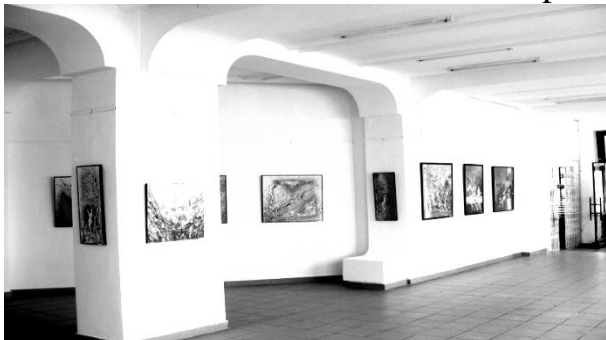
Fig. 2. Galeria de Artă Cupola 187

closed for a long time, but when it reopened it was only a third of the original space, but in 2022 the space closed for rehabilitation. However, several local institutions have looked for different solutions for setting up other exhibition spaces, creating a beneficial environment for the development of artistic life.