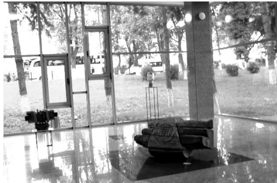
Fig. 7. Sala pașilor pierduți 190 Fig. 8. Galeria de artă Sala de Marmură, Facultatea de Medicină Veterinară, Iași

We also recall the importance of unconventional exhibition spaces, thus, the alternative art galleries (Vector and Tranzit Galleries) have made a considerable contribution to shaping an artistic life, promoting both Iași artists and artists from the country or abroad, by organizing numerous exhibitions, debates, book launches, being a support framework for local cultural values. The alternative art gallery Vector is the first independent space from Iasi for the promotion of contemporary visual arts, supporting the idea of an alternative to the current system of galleries. The projects of the Vector gallery consist in the presentation of exhibitions, the organization of workshops, documentary meetings, conferences, alternative cultural events, with invited local, national and international creators.