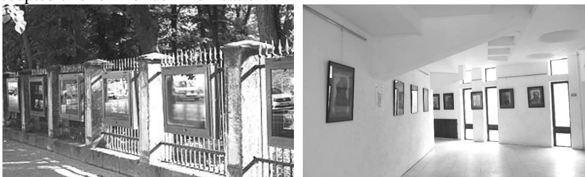
Fig. 12. Galeria de Artă La Gard din Parcul Copou 194 Fig. 13. Casa de Cultură „Mihai Ursachi” Galeria Labirint

Among the private galleries, we mention the Dana Art Gallery, established in 2006. The gallery managed to combine exhibition events with editorial projects, becoming a benchmark for visual art from Iasi. In the more than 15 years of existence of this gallery, have exhibited numerous important artists from Iași and from other localities in the country and abroad. From the series of original galleries, can also be noted the open-air exhibition space Galeria La Gard in Copou Park, which is a place appreciated by both artists and the public who immediately accepted this form of communication.