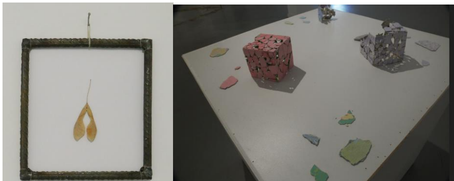
Fig.no. 5, 6 Emery Hall, SUA (Arizona), multi-media solo exhibition Anamnesis , Aparte Galery, Faculty of Visual Arts and Design, George Enescu National University of Arts, Iași, UNAGE Iasi Art Residency Program , 16.06.2022, pieces of dried maples fruit, 20x20 cm each work, and cube from chiped paint, 10x10 cm each work

as you can notice in the images below: figures no. 5, 6 and 7) to literally immerse herself in a new environment and reveal the evanescence of local modicums. Some withered leaves are framed separately with iron sticks in order to highlight the beautiful plant structure, which is usually ignored by pedestrians in our daily life, but also in order to bring to light the relationship between fragility and hardness, between ephemerality and lastingness. The small pieces of walls themselves make reference to our communist background which still exists within a transgenerational trauma unconsciousness, despite the ‘physical’ deconstruction of this political regime; they still affect our mind which is very fragile and carries in its memory a collective pain.